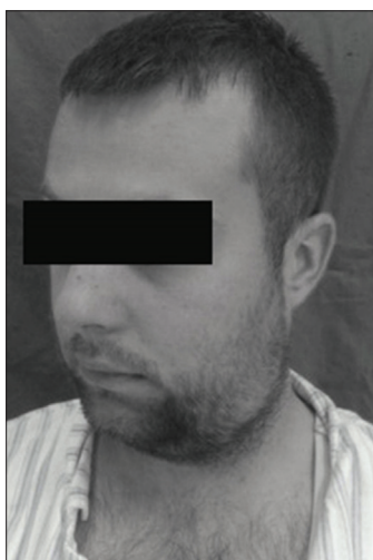
Figure 1. Swelling of the left neck side