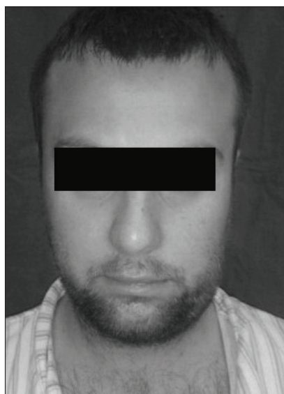
Figure 3. Regression of swelling of the left side of the neck after seven days of therapy