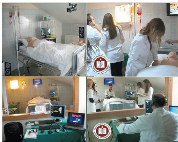
Figure 2. Actual view of our Simulation Center and work done in it