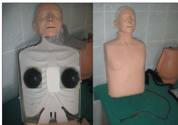
Figure 3. Speakers installed in the manikin's torso connected to the computers in the command room to emit heart sounds and murmurs, as well as lung sounds

printed materials (anamnesis, disease history, laboratory test results, therapy chart, and list of vital signs). There are also a lightbox, manual defibrillator, and AED (remote controlled from the command room) in the simulation room. A separate part of the room is used to keep medication and equipment for airway management, orotracheal aspiration, and thoracic drainage. Depending on the type of scenario, the simulation room can be turned into an emergency room, a pediatric intensive care unit, a or patient room.