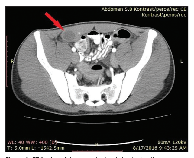
\textbf{Figure 1.} \ \mathsf{CT} \ \mathsf{finding} \ \mathsf{of} \ \mathsf{the} \ \mathsf{tumor} \ \mathsf{in} \ \mathsf{the} \ \mathsf{abdominal} \ \mathsf{wall}