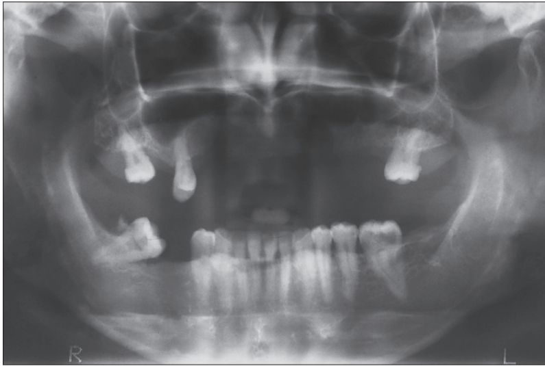
Figure 1. Panoramic radiographic view of a well circumscribed radiolucency in the anterior maxilla; a presumptive diagnosis of residual cyst was made