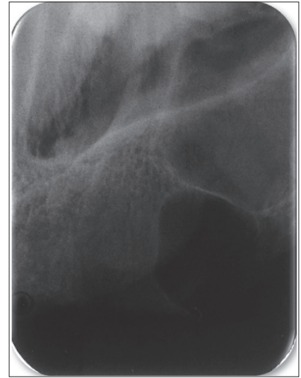
Figure 2. Detail of the radiolucent lesion, which extends to the cortical alveolar process