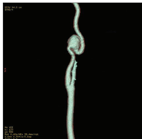
Figure 1. Multislice computed tomography angiography; the right internal carotid artery aneurysm associated with medial kinking

The patient underwent surgery in general anesthesia. Carotid arteries were exposed