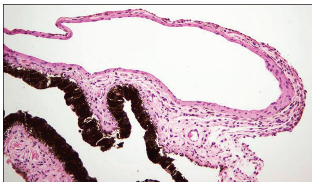
Figure 4. Histopathology of excised tissue demonstrating intrastromal iris cyst (H&E, \times 200 )

Short course of steroid drops, 0.1% dexamethasone four times a day for four weeks, was ineffective in reducing signs and symptoms of irritation. Considering slow progressive growth of the iris stromal cyst, long-term consequences of steadily enlarging corneal endothelial touch surface as well as significant irritation of the left eye affecting the quality of life of this patient, we decided to perform laser photodisruption with cyst deflation, as the first step of the procedure. Nd:YAG laser puncturing of the cyst wall was done at a setting of 1.9 mJ for a total of five spots. The cyst collapsed and fluid leaked out in the anterior chamber. Postoperative medication included topical steroids and antibiotics four times a day for two weeks. However, at three weeks of follow-up, the cyst recurred and more extensive Nd:YAG laser photodisruption of the entire anterior cyst wall was carried out.