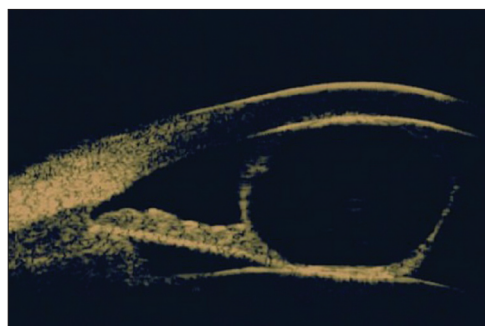
Figure 2. Ultrasound biomicroscopy showing the cyst extending into iris stroma