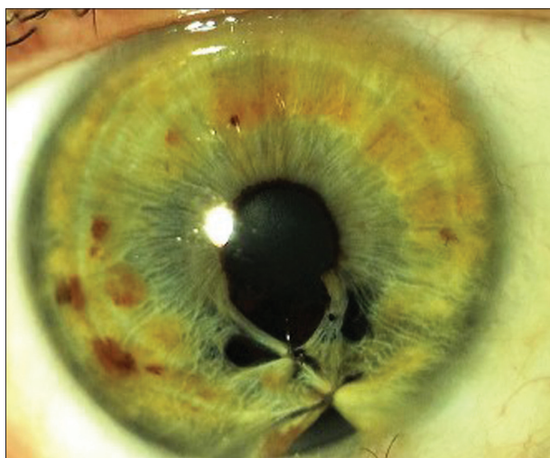
Figure 3. Clinical photograph showing the eye after surgical excision of the cyst