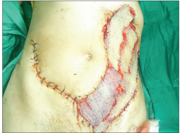
Figure 3. Abdominal wall reconstruction with partial-thickness graft

abnormalities: white blood cell count 8.5, red blood cell count 2.88, hemoglobin 75 g/l, hematocrit (HCT) 26.9%, C-reactive protein (CRP) 294.2 mg/l, total protein 43.7 g/l, albumin 17.4 g/l. Clinical examination revealed an incision on the right side of the anus with secretion of small amounts of pus, with signs of cellulitis on the left side spreading up toward the left vulva area. Due to unsatisfactory clinical finding, the patient was referred to another surgical procedure the same day. After incision, antibiotics were prescribed (meropenem 1 g / 8 hours and ampicillin 1 g / 8 hours), as well as paracetamol and fluids in consultation with gynecologist. During the morning round, the patient complained on intense abdominal pain. Body temperature was still normal. Clinical examination revealed only discrete redness of the skin which was tender on palpation and crepitating (Figure 1). She was immediately referred to surgery, since NSTI was suspected. Intraoperative findings revealed massive soft tissue infection spreading from left perineal region up to the chest wall, predominantly on the left side (Figure 2). Wide skin incisions and excisions followed by necrectomy and debridement to the anterior abdominal wall were performed. Septic shock developed immediately, requiring mechanical ventilation in the postoperative course. The patient was hypo-