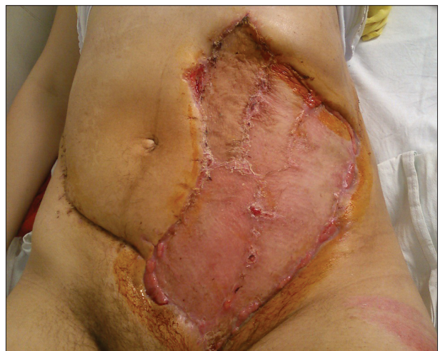
Figure 4. Abdominal wall at hospital discharge

tensive (80/40 mmHg), with heart rate of 128 beats/min., and arterial blood gas confirmed metabolic acidosis. Laboratory results showed hemoglobin to be 62 g/l, HCT 18%, total protein 35.1 g/l, albumin 12.5 g/l, CRP 206.7 mg/l, while body temperature rose to 38.6°C. After initial resuscitation, one day after admission, the gynecologist confirmed intrauterine death of twins based on ultrasonography and indicated labor induction. Over the next few days the patient was treated in the intensive care unit with broad-spectrum antibiotics, and her general condition improved. Wound dressing was performed at least twice a day. Wound cultures identified Acinetobacter spp. and Enterococcus faecalis , and antibiotic therapy was modified accordingly. On the seventh postoperative day, mechanical ventilation was no longer needed. On several occasions the wounds were aggressively debrided under general anesthesia, which left the patient with a large abdominal wall defect. After stabilization, she was referred to the Clinic for Plastic and Reconstructive Surgery for the further treatment. Twenty-three days after the initial operation, the skin defect was reconstructed with partial-thickness skin grafts (Figure 3). Eleven days post transplantation, the results were satisfactory. She was discharged from the hospital 44 days after admission (Figure 4).