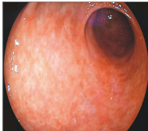
Figure 1. Upper gastrointestinal endoscopy showing mucosal erythema

A 45-year-old woman with pulmonary sarcoidosis in remission developed epigastric pain. The diagnosis of pulmonary sarcoidosis (stage II) without extrapulmonary disease manifestations had been established ten years previously, when