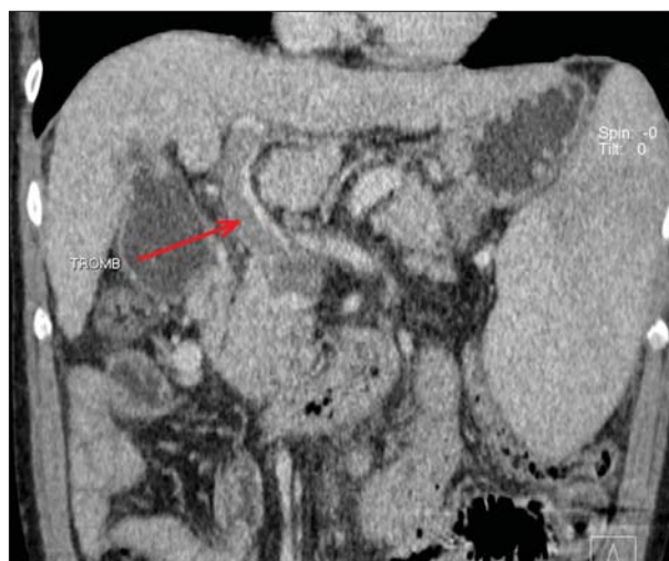
Figure 2. Contrast CT scan – portal thrombosis

flow in it and in its feeding branches, as well as in collaterals developed due to the portal hypertension.