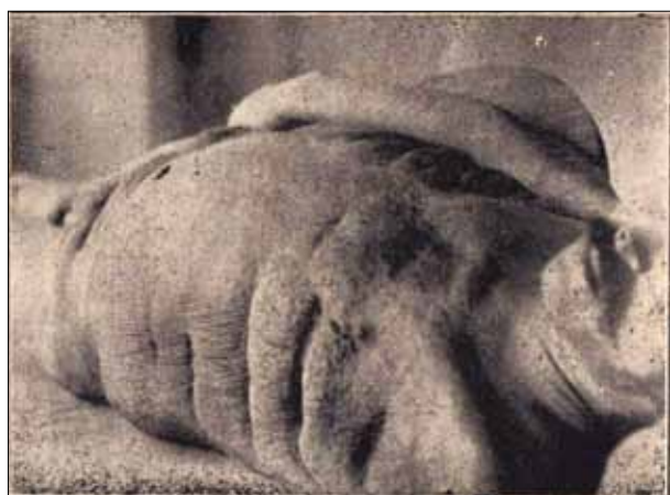
Figure 2. The skin of the thorax, abdomen, scrotum, and the upper half of the thighs was livid-red, dry, very hard and thickened, with creases, folds and cuts as deep as seen in elephantiasis, particularly conspicuous on the side, under the armpits and in the groin [6]

the scalp was very thin, hairs small and "moustache very sparse and falling off." Submandibular and neck lymph nodes were not enlarged, while the axillar and inguinal ones could not be palpated because of the thickened skin. The tonsils were of normal size. The infiltrated and thick skin allowed no palpation or percussion of liver or spleen.