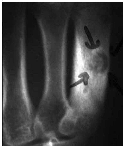
Figure 1. Plain radiograph of the first patient shows nidus and surrounding sclerotic bone

An 18-year-old male was admitted to our clinic in January 2013 due to the pain in his left hand for one year. He was given rest and analgesics in the previous medical center but his com-