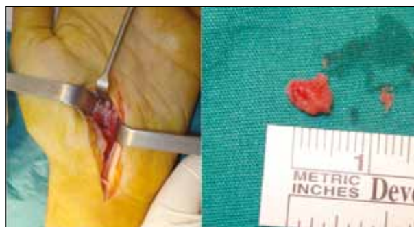
Figure 4. Intraoperative view of the lesion

Under general anesthesia, an arm tourniquet was applied. A 4 cm longitudinal incision parallel to the thenar crease was made. The transverse carpal ligament was cut. The median nerve and flexor tendons were retracted in order to reach the carpometacarpal joint. The joint capsule was opened and the lesion was exposed. The nidus was excised and the cavity was debrided (Figure 4). The skin