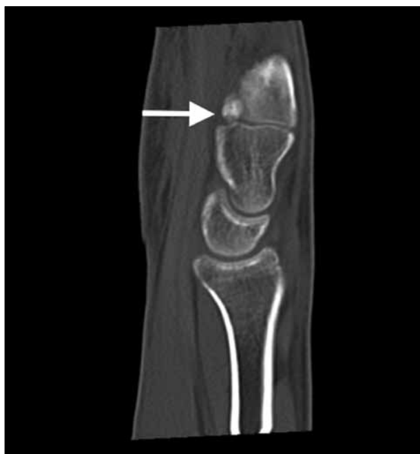
Figure 2. In the computed tomography section of the second patient, a sclerotic lesion was observed at the proximal palmar side of the third metacarpal