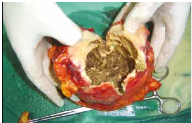
Figure 4. Gross finding of bisected teratoma of the mesosigmoid

intra-abdominal cystic masses includes mesenteric cysts, cystic teratoma, and cystic mesothelioma [24]. Since the definitive diagnosis can be made only on the basis of histopathological examination, complete surgical removal of the cyst is the only way in the treatment of these patients. Although laparoscopic surgery has been used in some cases [3, 19], the majority of authors, including our group, gave preference to a standard laparotomy approach [7–18, 20–23]. We chose laparotomy over laparoscopy for several reasons: the size of the tumor, intestinal obstruction with consecutive bowel distension and a possible interference of the tumor with adjacent blood vessels and organs.