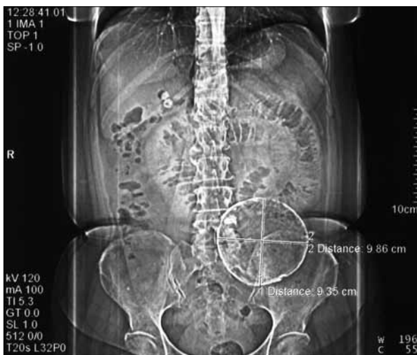
Figure 2. CT scan of the abdomen and pelvis – coronal view