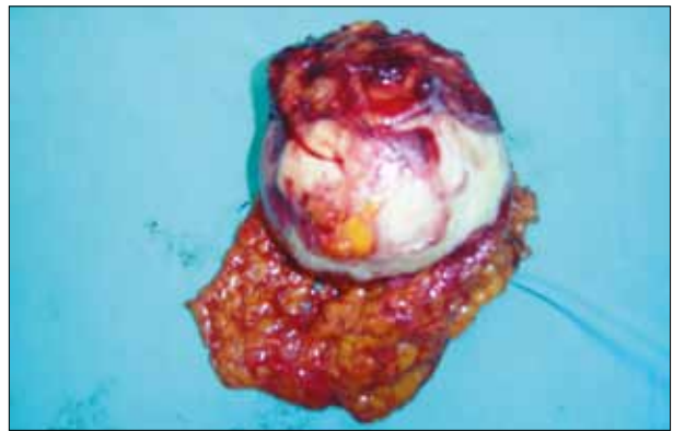
Figure 3. Gross finding of teratoma of the mesosigmoid with resected part of the great omentum

Whereas these tumors are very rare, it is very difficult to establish a correct preoperative diagnosis with all available diagnostic imaging tools. The differential diagnosis of