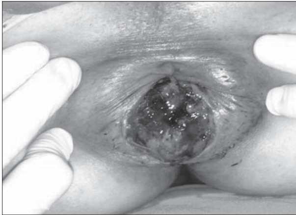
Figure 1. Anorectal melanoma (ARM) located above and below the dentate line with obstruction of the lumen of the rectum