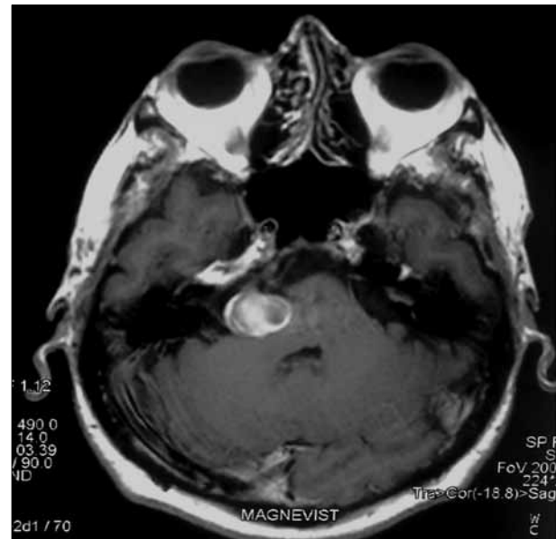
Figure 2. Axial MR images with gadolinium show a partial thrombosed fusiform aneurysm of the basilar artery and a double lumen of the fusiform basilar dissection. The external wall of thrombosed aneurysm is with recent hemosiderin deposition.