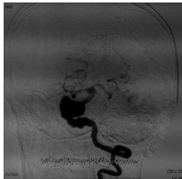
Figure 4. Digital subtraction angiography image

form of vertebrobasilar aneurysm, characterized by dilatation and elongation of an artery [5]. The origin of fusiform aneurysms is unclear and several hypotheses exist. They are most common in elderly patients with advanced atherosclerosis and hypertension, and are believed to be the result of a degenerative process of the arterial wall [6]. Contrary, other authors stated that out of 120 patients with giant fusiform aneurysms, who underwent surgical treatment, atherosclerosis was found in only six of them. A congenital anomaly, mechanical injury by post-stenotic turbulence, intimal disruption from arterial dissection and severe reticular fiber deficiency in the muscle layer have been proposed as alternative explanations for the formation of fusiform aneurysms [7]. It was speculated that initial event in the formation of