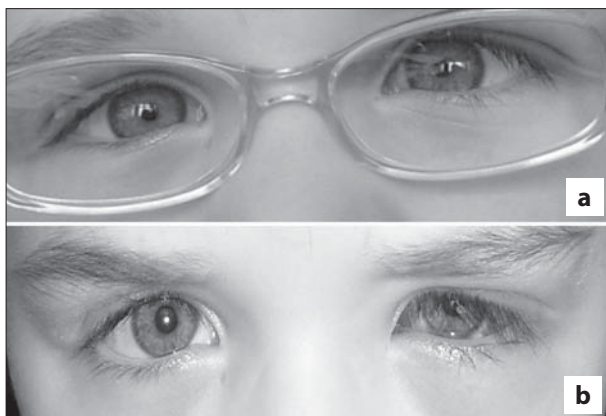
Figure 3. Twin 1 left eye before (a) and after surgery (b)

0.25 (180)]. The Twin 2 developed left eye myopic astigmatism and emmetropia in the right eye [right plano/-0.25 (180), left -6.0/-3.50 (180)]. The cover-uncover test was conducted and no objective deviation was found. A-scan axial length measurements were 26.22 mm/23.29 mm in the Twin 1 and 23.61 mm/26.67 mm in the Twin 2. The keratometer readings were 41.00 D/43.25 D in the right eye and 42.00 D/42.50 D in the left eye of the Twin 1 and 41.75 D/42.25 D in the right eye and 41.00 D/44.50 D in the left eye of the Twin 2.