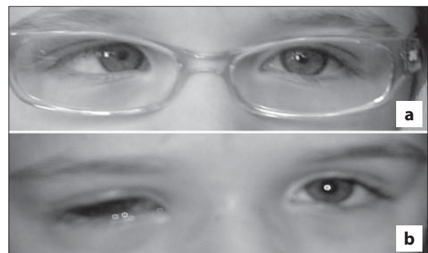
Figure 4. Twin 2 right eye before (a) and after surgery (b)

The second was a pair of six-year old twins with "mirror-image" esotropia and hypermetropic astigmatism. The children were born from the first regular full-term pregnancy, with no eye disorder family history, and an eye turn observed at the age of two.