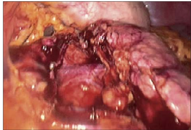
Figure 1. Transection of the pancreas

The laparoscopic surgery started by creating a pneumoperitoneum of 12 mm Hg through an incision of the skin above the umbilical level. An 11 mm optical trocar was placed into the abdomen for exploration, but no pathological changes were found. Additional 11 mm trocars were placed in the midclavicular line, subcostally to the right, and in the axillary line to the left at the umbilical level. One 5 mm trocar was placed in the anterior axillary line to the right at the umbilical level for aspiration. The hepatic flexure of the colon was mobilized and the gastro-colonic ligament was opened using ultrasonic scissors, which were further used for preparation. The anterior part of the pancreas was visualized, but the lesion could not be seen, due to its size of 7-10 mm. The anterior edge of the pancre-