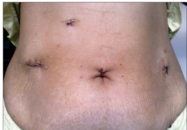
Figure 2. Drains removed