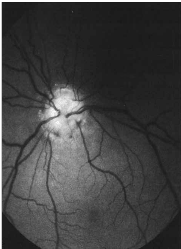
Figure 1. The fundus in the left eye