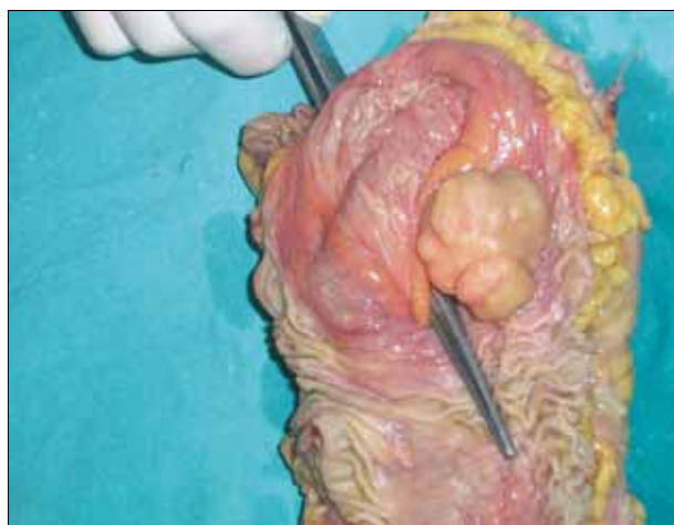
Figure 1. Gross finding of pedunculated lipoma of the ileocecal valve