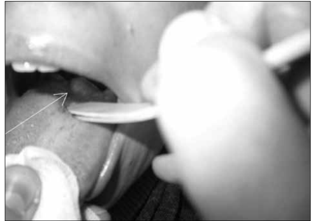
Figure 2. By the maneuver of tongue traction and pressure to the median and last third of the tongue, ectopic thyroid gland is completely presented. It is localized in the middle line and stretches to the left side. Its dimension is 2x2.5 cm; it is of rosy color, smooth surface, clearly demarcated from the surrounding tonsillar tissue of lingual tonsils.