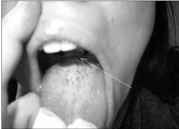
Figure 1. Rosy change of smooth surface with visible blood vessels. With the help of endoscope for indirect laryngoscopy it is not possible to present ectopic thyroid gland completely. A smooth rosy change is observed which completely fills the visual field of endoscope along with traces of blood vessels.