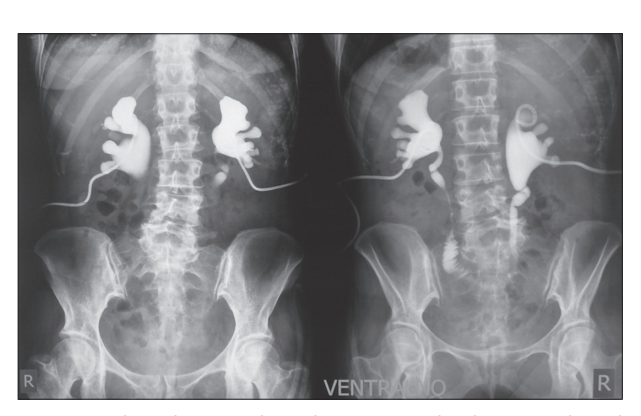
Figure 3. Bilateral antegrade pyeloureterography shows good renal drainage after ileal ureteral replacement